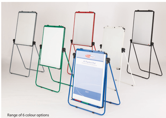
Range of 6 colour options